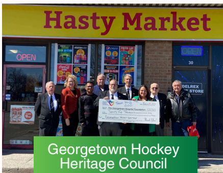
Georgetown Hockey Heritage Council