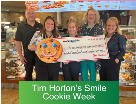
Tim Horton's Smile Cookie Week