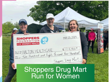
Shoppers Drug Mart Run for Women