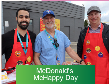
McDonald's McHappy Day

Community engagement is at the heart of our efforts. This past year it played, and continues to play, a pivotal role in our success. We extend our deepest gratitude to each and every community and corporate partner!