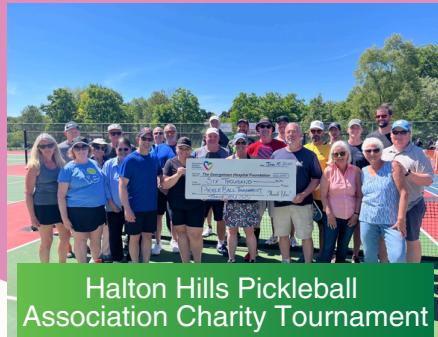
Halton Hills Pickleball Association Charity Tournament