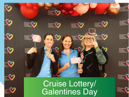
Cruise Lottery/ Galentines Day